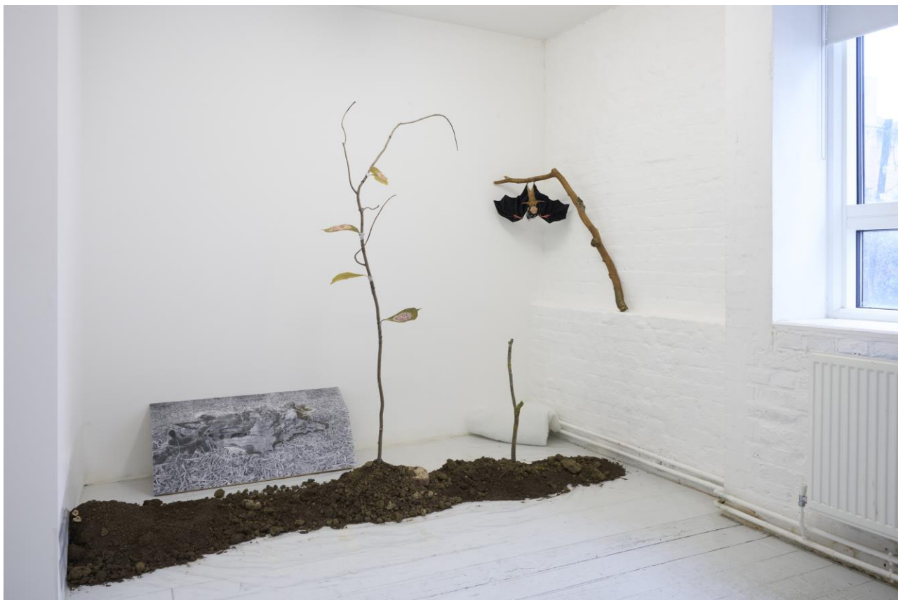
Mithra K studio, Gasworks' Open Studios, September 2024