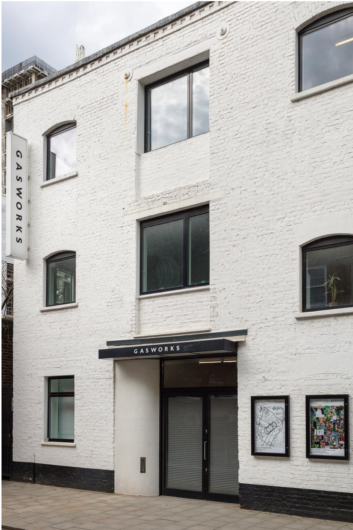
Outside of Gasworks, London, 2024